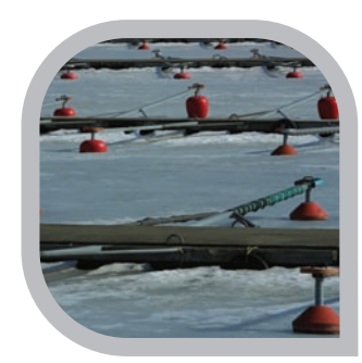
>> Wastewater & Water Treatment

Applications: • Water quality testing • Checking metal finishes • Solutions • Cooling tower water • Printing fountain solutions • Boiler water • Brines • Drilling mud • Rinse tanks • Ponds • Pollution control • Recirculating systems • Waste water • Industrial process systems • General use in laboratories • Titration • Quality assurance • Ecological studies • Food-processing