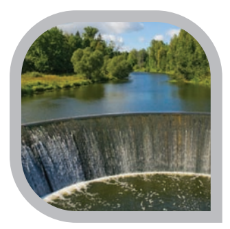
>> Ecological Studies